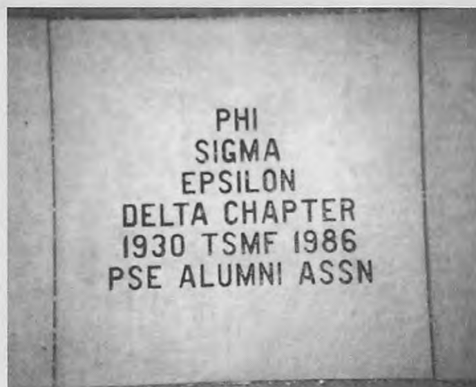
PSE engraved paving stone.

Our engraved paver block rests about midway along the northern (closest to McAfee) perimeter of the entire layout. Although the engraving is correct, the layout is not quite exactly as the PSE Alumni Assn. Board hoped it would be. During an earlier in the year Board meeting, the design and wording was put forth by those present, in the hope that the layout would allow for a more triangular shape to our inscription. In our application for this paver engraving, we were allowed a maximum of 15 letters/numerals (including spaces between letters or numerals) per line. We had hoped that the first four lines could be