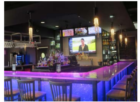
Bar inside of "Brickhouse" bar

had worked out well. However, since the last Reunion, the entrance door to the entire establishment has been moved to the previously private room and gambling machines (now legal in Illinois) line the entire west wall of the room. In addition, a substantial new bar has been built in a corner and the once-private room can no longer be rented for private parties, so we would have to compete with both a gambling and drinking populace all evening. Where does that leave us, you ask! Well, we are hopeful that you will like our new choice for the Friday night gathering. It will take place on Friday, Sept. 12 th in the upstairs private party rental area at Roc's (now called "Top of the Roc"), just off the square uptown. I shouldn't have to say any more about it's location-we have all been there, I'm sure. We can start gathering at 6 PM and we will have the place to ourselves, complete with our own bar and bartender upstairs. There is plenty of room and seating, although we will finalize all those details before the event. Now, the only drawback we concerned ourselves with, is the stairway entrance from Roc's