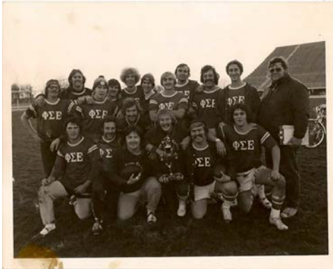
EIU Intramural Champions-Fall 1975