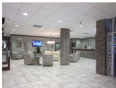
Headquarters and Entrance foyer at our hotel for the 85th PSE Reunion-June 12-14, 2015