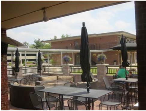
Outside lounge area adjacent to "Brickhouse"

interior to the upper floor. There is no elevator and we discussed the ramifications of that stairway, both ascending and descending, and decided to go forward with it, because there