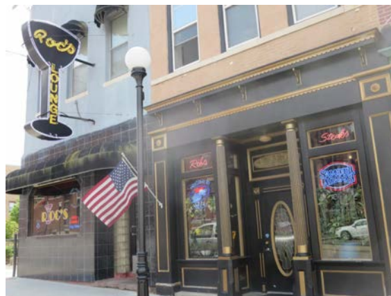
Roc's Bar-site of the Friday night Phi Sig get-together

time, I cannot give you a firm room rate