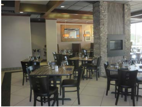
Interior of "Brickhouse" restaurant

fixtures, new paint schemes and HVAC (heat/air cond.) improvements. Some of the other 15 rooms may see some upgrades before our event, but a number of them will retain