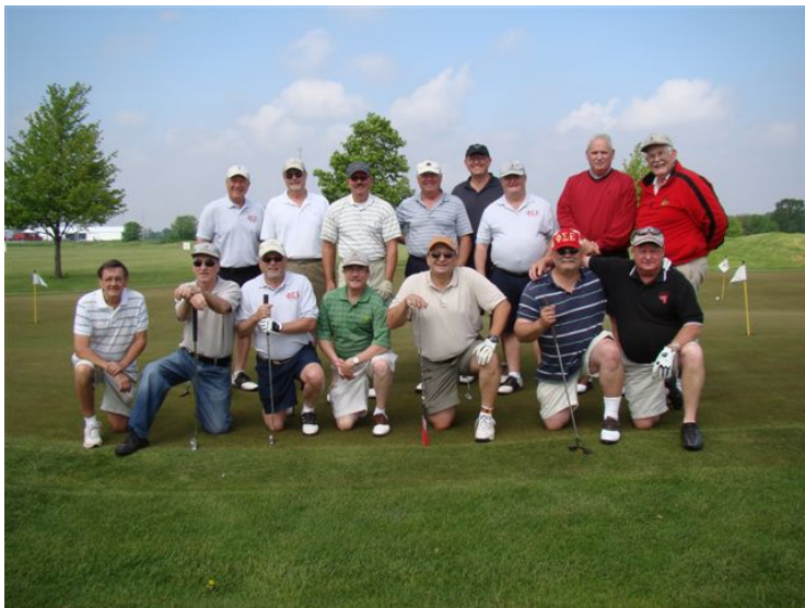
PSE Golfers at the Railside: