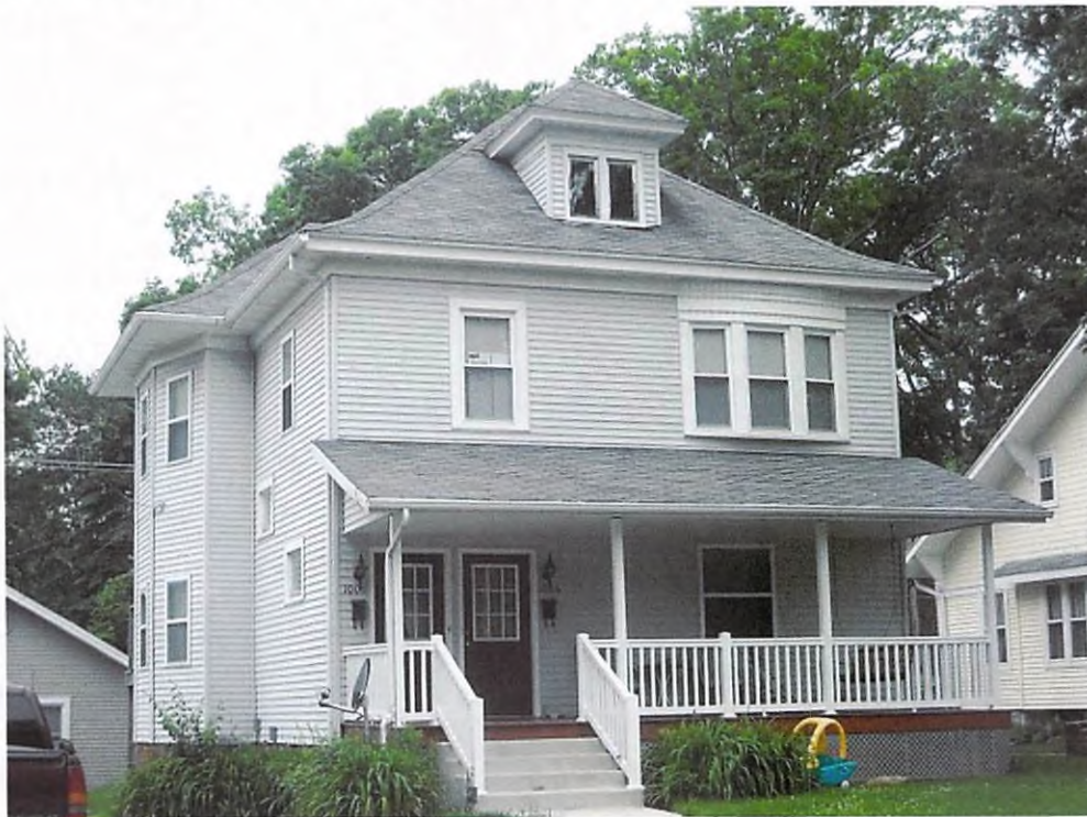
Delta Lambda Sigma fraternity house - 1006 Tenth St. Charleston, IL

So now we have come full circle and in the immortal words of Paul Harvey, "now you know.... the rest of the story."